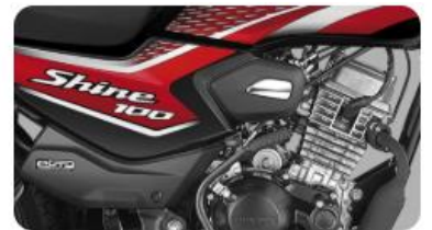
100 cc BS-VI OBD2B Compliant Engine Honda's 100 cc BS VI OBD2B-compliant engine ensures superb performance, unmatched reliability, and best-in-class mileage. It offers optimum riding experience while following OBD2B norms.