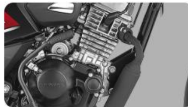
PGM-FI Fuel Injection Advanced sensor-based system ensuring constant optimum fuel flow to the engine based on the riding style, allowing for higher efficiency and lesser emissions.