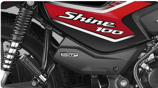
eSP Technology Reduced friction and improved performance and fuel efficiency.