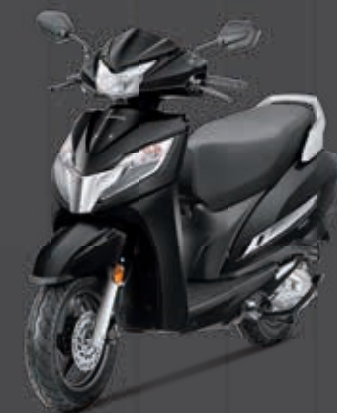
PEARL NIGHT STAR BLACK