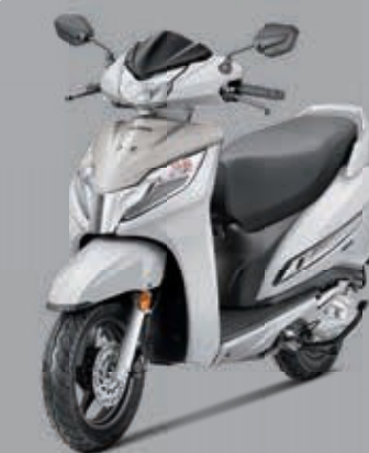
PEARL PRECIOUS WHITE WITH SALEN SILVER METALLIC