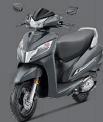
HEAVY GRAY METALLIC