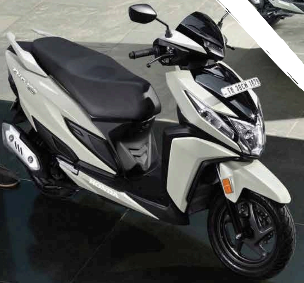
Pearl Deep Ground Gray with Graphics