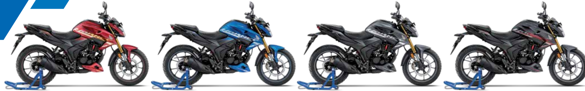
MATTE SANGRIA RED METALLIC