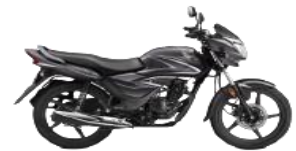
GENNY GREY METALLIC