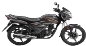
MATTE AXIS GREY